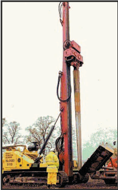
Vertical Vibrating Taper Poker

The Megacone Concrete Foundations were installed with repeated compaction blows to achieve a pre-determined set and were subsequently driven on until the collar of the Megacone came to rest at ground level. This procedure created a Displacement Foundation, as detailed on the photographs (right), which was filled with concrete to the specified cut-off level.