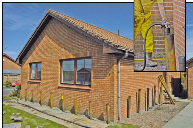
External Angle Piles - Ready for driving (Inset - External Angle Piles - Being driven to suitable bearing stratum)