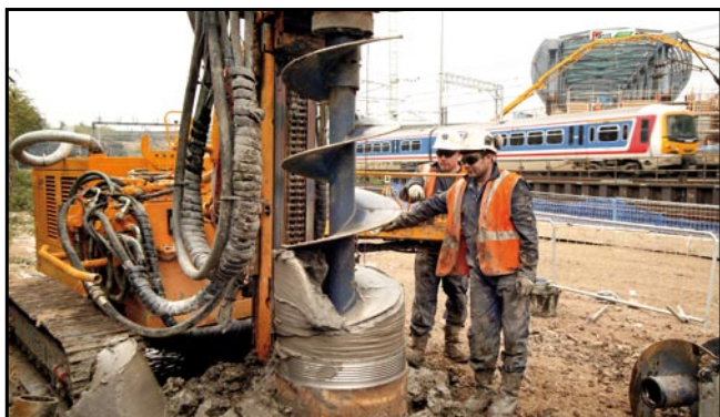
1 Bridges - Refurbishment/Newbuild

Association of Specialist Underpinning Contractors and Engineered Foundations