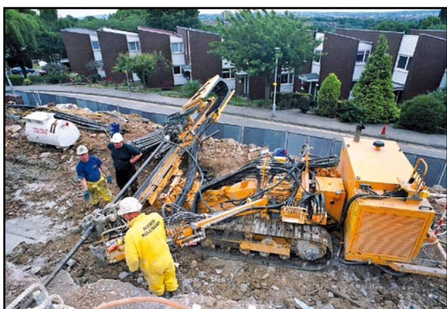
2 Embankments - Soil Nails

Using a short masted rig enables us to install large diameter piles normally associated with conventional piling, thus delivering a safe engineered solution.