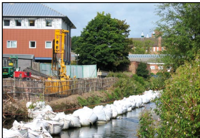
1 Flood Defences - Docks - Harbours

Association of Specialist Underpinning Contractors and Engineered Foundations