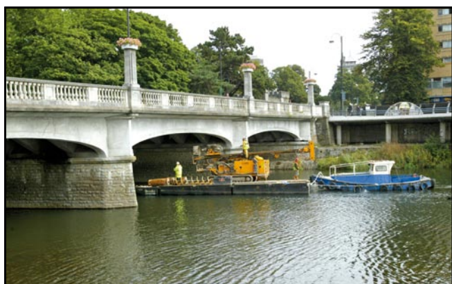
2 Ports - Marinas - Pontoons

Where the protection of the environment and flood defences are essential, the piling contractor has many issues to consider, not least design. RBL has a design team who will ensure all of these issues are taken into account whilst still offering the most cost effective and environmentally friendly solution.